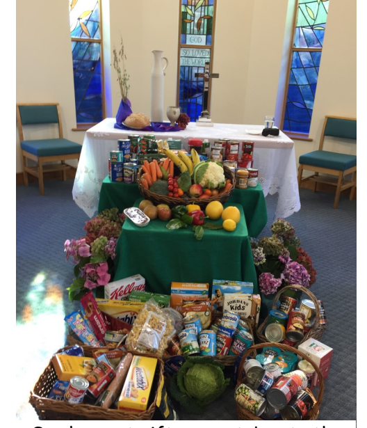
Our harvest gifts were taken to the Grace Food Bank

We are more part of the solution than part of the problem... We heard about how we can make adjustments such as offsetting costs of carbon footprint, changing to more sustainable energy providers, reducing energy, using local produce, reusing and