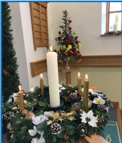
Advent Wreath - four gold candles were lit during each Sunday in Advent and finally the central white candle was lit on Christmas Day.

53 shoe boxes were filled and collected for Operation Christmas Child.