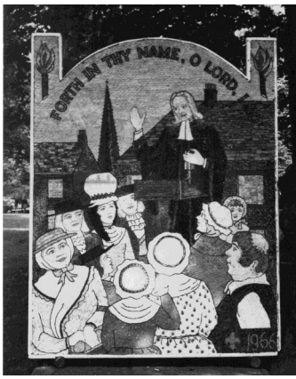
Dore Well Dressing 1966: Wesley preaching in Paradise Square

At that time I had a Nagging Doubt, not a mini-monster but a cat in the bag which I kept quiet about but now feel I should let out. Were we a year late?