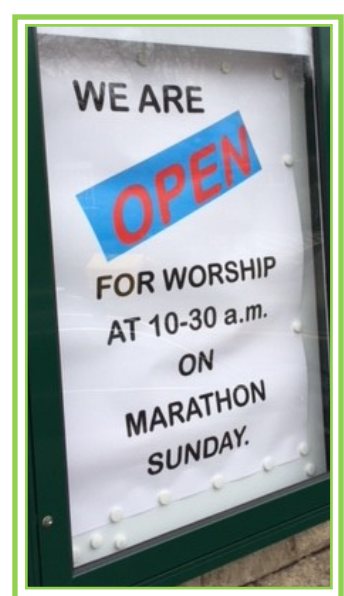
Did anyone jog to church?

To book the church hall please phone 0114 2365043