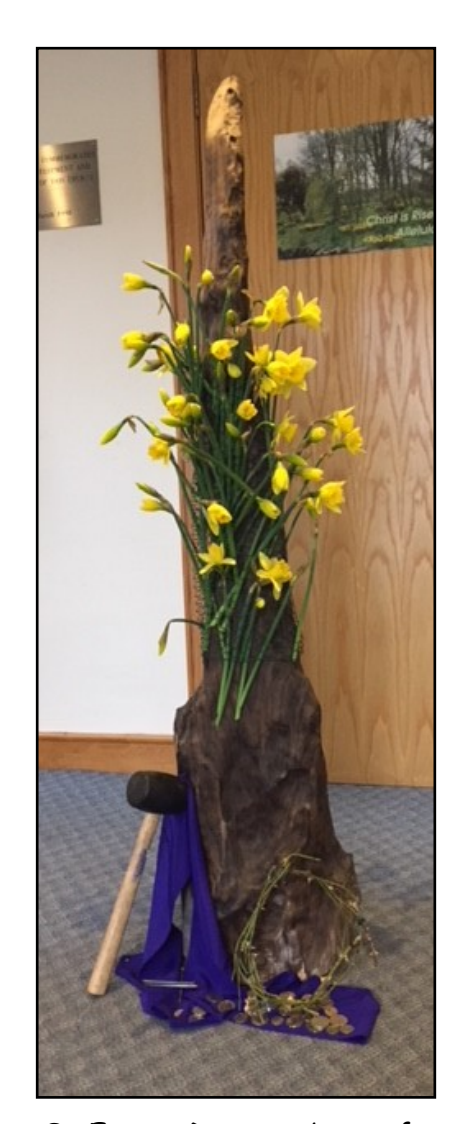
On Easter Day members of the congregation were invited to put a daffodil on our symbolic wooden cross.