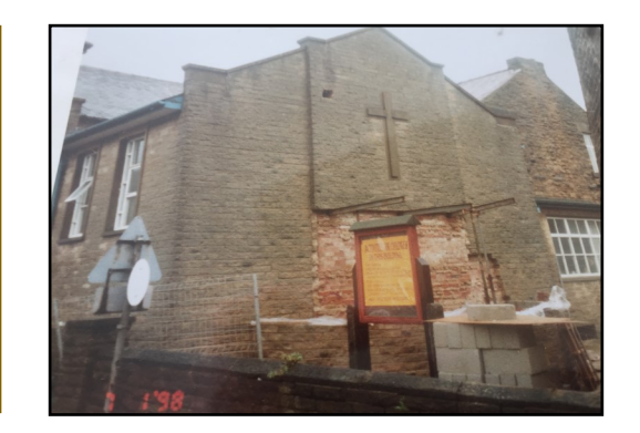
Do you recognise this photo? Does the building look familiar?